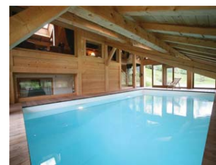
Indoor Swimming Pool Interest/Priority Rating High Med Low Not